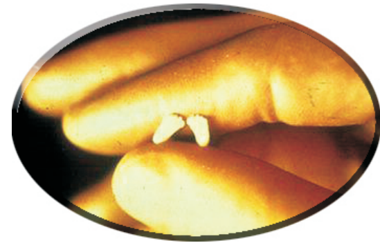
Unborn baby's feet at 10 weeks

The Bible teaches us that GOD IS THE SOURCE OF ALL LIFE.